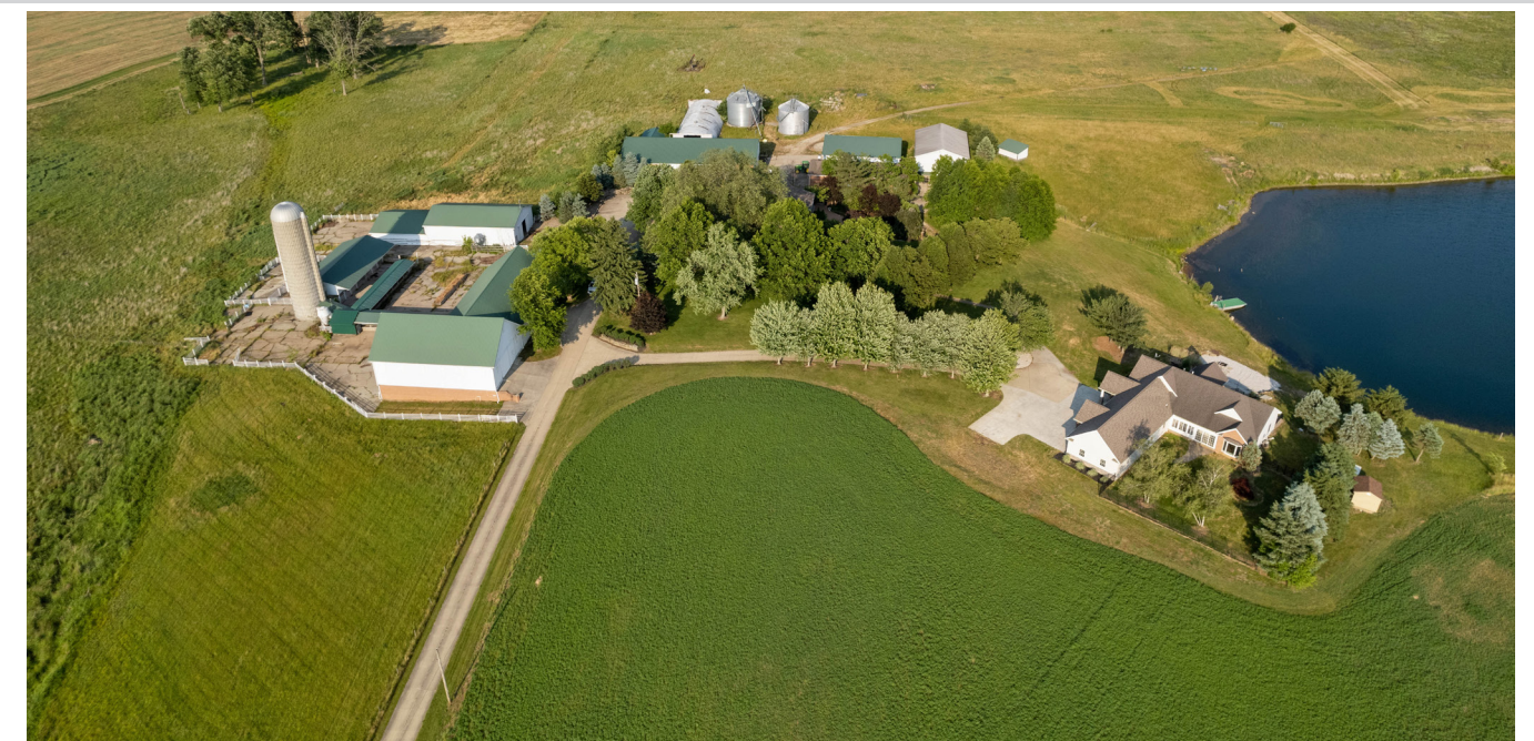
Information is believed to be accurate but not guaranteed. KIKO Auctioneers

Auctioneer/Realtor® JOHN D. KIKO 330-455-9357 ext. 122